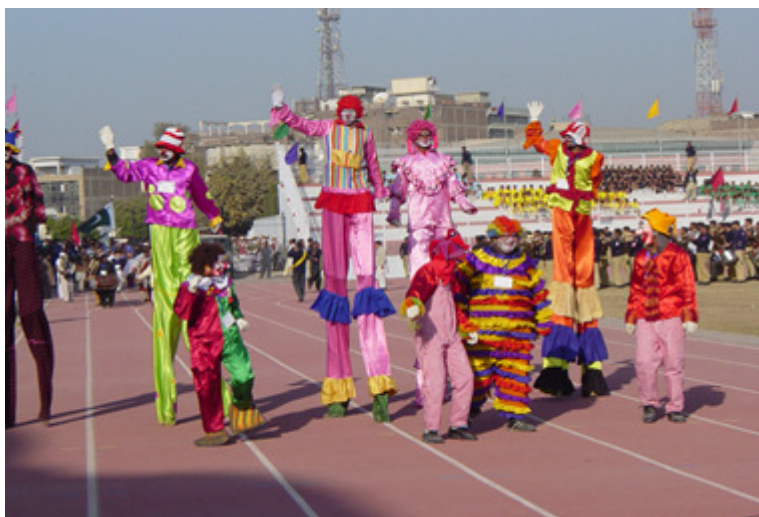
Jokers at the Opening Ceremony of the 31 st National Games