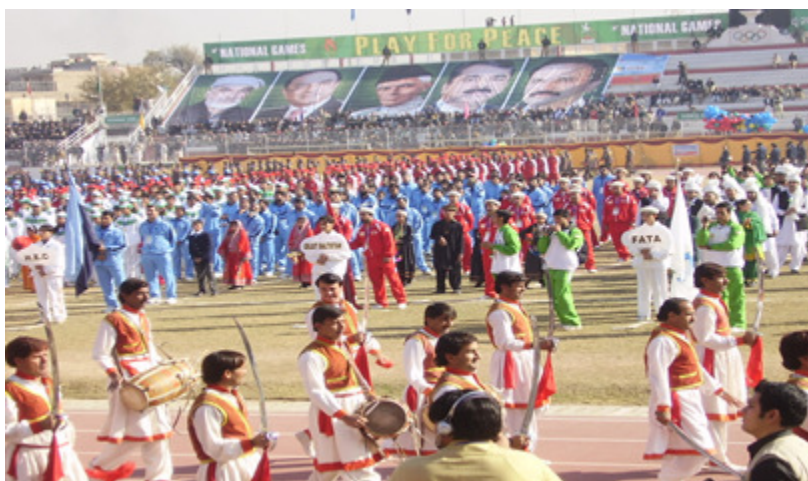
HEC Squad in Blue Color at the Opening Ceremony of the 31 st National Games

Coach of HEC team was selected from the first three position holder teams of the Intersarsity Championship of the relevant event on merit in consultation with the HEC team Manager.