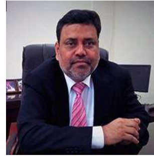
100541105 of graduates III

A university is not just a degree awarding institution but also the highest seat of learning where students are given the opportunity to achieve academic excellence along with refinement of character, so that they make meaningful contribution in society. The University of Karachi was established with the same vision in 1951 and since then it has been actively engaged in imparting quality education with a special focus on research in a variety of disciplines. The teachers and research scholars working in the 54 departments and 19 research institutes of